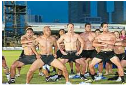
Haka being performed at the SCC Rugby Sevens

The Haka is a traditional ancestral war cry, dance or challenge from the Māori people of New Zealand. It is a posture dance performed by a group, with vigorous movements and stamping of the feet with rhythmically shouted accompaniment. The New Zealand rugby team's practice of performing a haka before their matches has made the dance more widely known around the world.