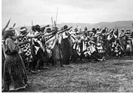
A group of men and women perform a haka for Lord Ranfurly at Ruatoki, Bay of Plenty, in 1904

The various types of haka include whakatu waewae , tutu ngarahu and peruperu . The peruperu is characterised by leaps during which the legs are pressed under the body. In former times, the peruperu was performed before a battle in order to invoke the god of war and to discourage and frighten the enemy. It involved fierce facial expressions and grimaces, poking out of the tongue, eye bulging, grunts and cries, and the waving of weapons. If the haka was not performed in total unison, this was regarded as a bad omen for the battle. The aim of the warriors was to kill all the members of the enemy war party, so that no survivors would remain to undertake revenge.