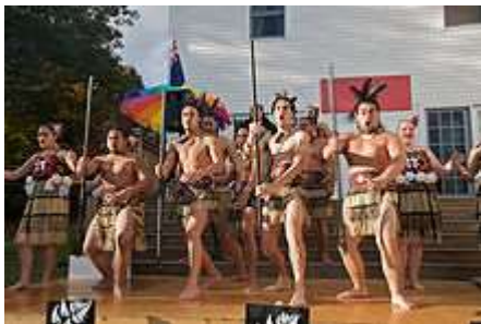
A performance by the Kahurangi Maori Dance group.

Most haka are performed by men, with the female role, if any, limited to providing support by singing in the background.